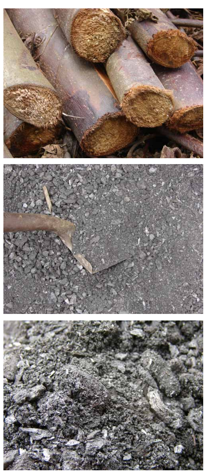
Production of biochar. Top, Melochia species logs (3–4 inches diameter) can serve as organic matter for biochar production. Center, biochar produced by heat treatment. Bottom, close-up of biochar particles; this material's size is called \frac{1}{2} ("half minus") because it consists of \frac{1}{2} -inch or smaller particles.

Yes. Studies in both tropical and temperate climates have demonstrated biochar's ability to increase plant growth, reduce leaching of nutrients, increase water retention, and increase microbial activity. In a study done on a Colombian Oxisol (a soil type also found extensively in Hawai'i), total above-ground plant biomass increased by 189 percent when biochar was applied at a rate of 23.2 tons per hectare (Major et al. 2005). Research indicates that both biological nitrogen fixation and beneficial mycorrhizal relationships in common beans (Phaseolus vulgaris) are enhanced by biochar applications (Rondon et al. 2007, Warnock et al. 2007). In Brazil, occurrence of native plant species increased by 63 percent in areas where biochar was applied (Major et al. 2005). Studies have also shown that the characteristics of biochar most important to plant growth can improve over time after its incorporation into soil (Cheng et al. 2006, 2008; Major et al. 2010).