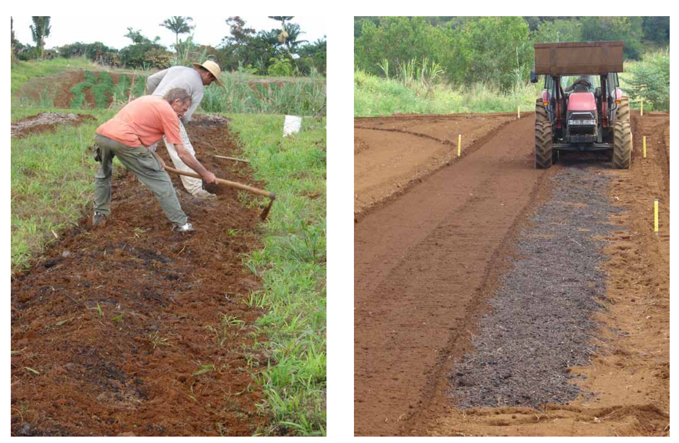
The biochar being applied in these photos weighed approximately 500 pounds per cubic yard. It should be spread evenly over the soil in a layer \frac{1}{4}-\frac{3}{4} inches thick (equivalent to 8.4–25.2 tons per acre). Hand tillage or a tractor-drawn rotavator can be used to incorporate it into the soil.

can be easily remedied by wetting the biochar before application. Respiratory protection (e.g., dust mask) should be worn when handling the dry material.